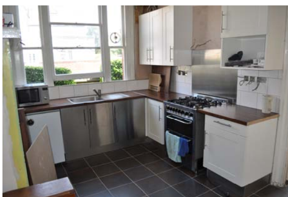
Work in the office kitchen is almost complete

There is still much to do and issues to deal with. We have been attempting to do some much needed maintenance around both the office and the church building. Unfortunately, we had a plumbing problem that resulted in a flood in my office. I was at a wedding reception when I received a phone call informing me that there was water coming into my office. I immediately headed to my office to find about an