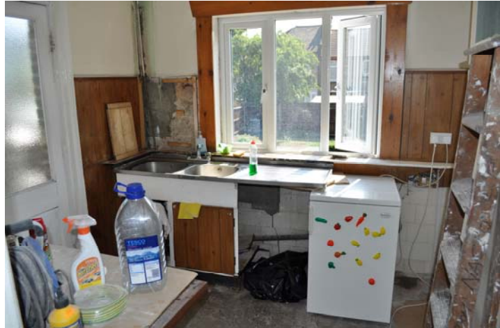
Still much to do in the utility room!

We began to refurbish the kitchen and utility room at the office in May and are continuing the work at a much slower pace. The main kitchen is getting close to completion and has a newly tiled floor, cabinets, electrics and a sink. We still have a lot to do in the utility room and will also add a second toilet where the pantry used to be. I am hoping that we will complete this stage by the end of the summer, but we also have some work to do with some of the windows, so we'll see how it goes. Please pray that God will supply the necessary finances to complete all that needs doing.